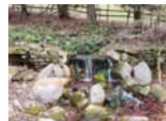
Hidden gem in Wheeling Park