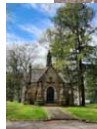
Beautiful mausoleum in Greenwood Cemetery