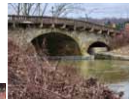
Oldest stone arch bridge in WV! Views around the Stifel Museum